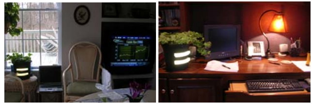
Fig 3. Ambient plant pots in participants' households

P5 initially placed the pot in the kitchen but then relocated it next to TV. They explained that the kitchen was not preferred because it is usually busy with many activities. Rather, they liked that they could see the plant pot while watching TV in the living room in the evening but noted that the light was quite distracting. P6 placed the pot on her work desk because the room is quiet and she spends much of her evening time there (Fig 3).