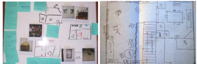
Fig 1. Maps of domestic activities and objects

Sketching exercises (Fig 1) were helpful for engaging participants in reflection on their everyday activities and emotional attachments to objects and spaces. Also, stories about favorite objects often provoked their life memories and relations with others (e.g., souvenir, sentimental heirlooms, family pictures, etc.). These exercises resulted in the creation of physical maps visualizing an ecology of social and material relationships which characterize the participants' daily domestic interactions.