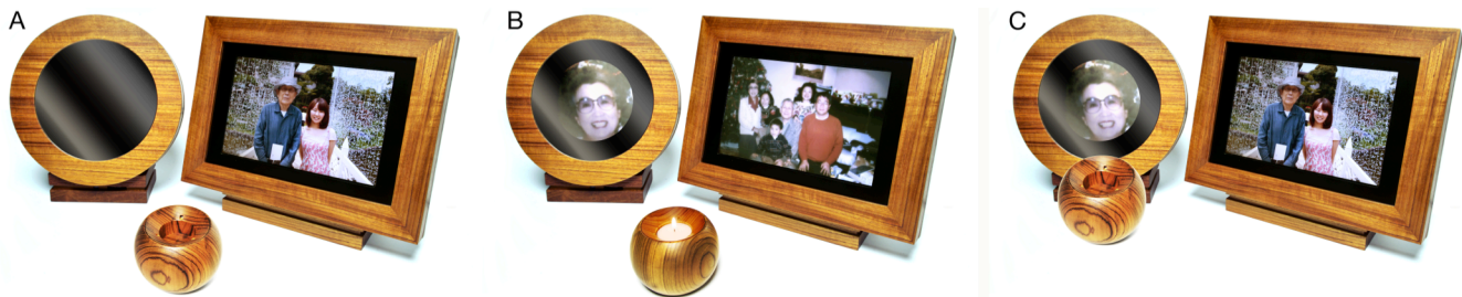
Figure 3. From left to right: (A) current photos can be viewed on the photo frame through simple swipe interactions (no image appears on the round mirror); (B) changes in the candle flame’s brightness and movement unpredictably triggers how old photos (on the photo frame) and face photos (on the round mirror) surface and are cycled through; (C) if the IR sensor is obstructed by a person or object (in this case the candleholder) a face photo will appear on the round mirror, even if current photos are being display (such as in this case).

like form as a subtle symbolic reference to the type of digital content it presents—mostly images of people still existing in the ‘lower’, living world.