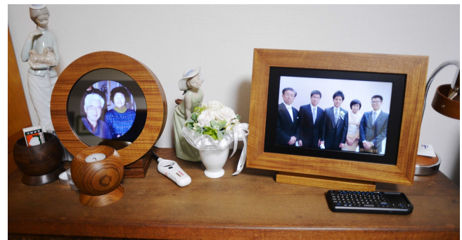
Figure 6. Rikako's practice of placing the candleholder in front of the mirror to trigger a collocated image of her parents to 'show' them a more recent photo frame image of her nephew's wedding.

In Rikako-H3's initial Fenestra deployment, we had generated two different cropped images (one for each departed parent) to appear on her round mirror. After using Fenestra during the initial interview, she asked us to depart from the reference to customary iei portrait photos (where only one person can be featured). Since she perceived Fenestra as existing outside of butsudān norms and believed her parents would have wanted to be together, we were asked to generate a new set of mirror images in which they were collocated (one such image is visible in Figure 6).