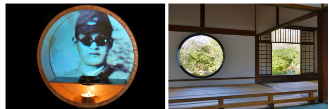
Figure 2. Left: Prototype of ThanatoFenestra [53], Right: Genko-an temple (Kyoto-city, Japan) we visited during our design process; the circular window is symbolic of the afterlife; the square-shape entrance is a gate to the living world.

We intended the design of Fenestra to reference some key elements emerging in our observations. Circle and square shaped windows were common across Buddhist temples we visited (see Right of Figure 2). Indeed, the name Fenestra is a reference to the Latin word for window. In Zen Buddhism, the circle symbolizes the afterlife paradise, whereas the square represents the lower (i.e. living) world. Candles also populated altars and temples, and are used in many different kinds of Buddhist ceremonies including funerals and memorial services. Here, candlelight symbolizes the journey of the departed's spirit to the afterlife.