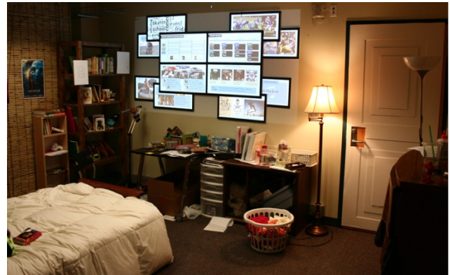
Figure 1. The messy teen bedroom prototyped in our lab.

Copyright 2012 ACM 978-1-4503-1015-4/12/05...$10.00.