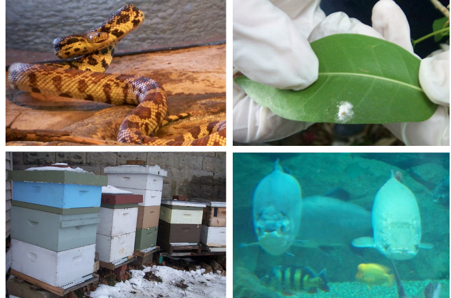
Figure 1. Everyday biomarkers: reptile posture suggesting a disturbance to the environment (top left); scale larvae signifying a pest problem (top right); bee behavior reflecting local weather and bloom cycles (bottom left); fish appearance indicating water quality and parasite levels (bottom right).

Copyright 2011 ACM 978-1-4503-0630-0/11/09...$10.00.