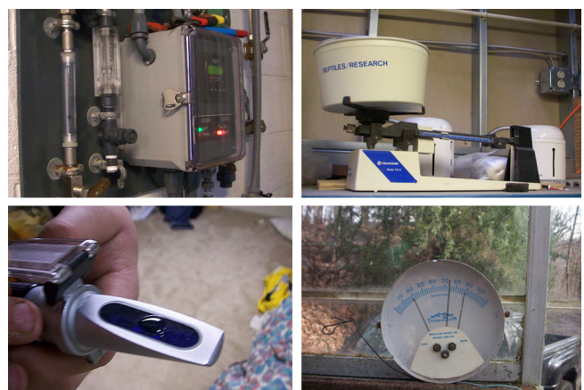
Figure 2. Technologies used by participants: ORP probe, routinely used to monitor ozone levels in aquariums (top left), scale for weighing reptiles (top right), refractometer, occasionally used to check honey before harvesting (bottom left); thermometer, checked daily (bottom right).

I watch to see what the weather is like: the flowers may be open, but maybe raining and the plant flowers can't secrete nectar, the bees can't get to the flowers, maybe too cold maybe very dry, there's not an excess moisture for the flowers to secrete a lot of nectar. (B1)