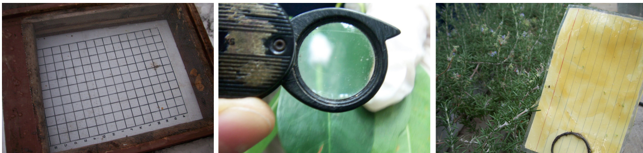
Figure 3. Magnification and counting tools: monitoring tray (left); hand lens (center); handmade sticky trap (right).

Similarly, F2 uses handmade traps (notecards covered with a sticky substance) to monitor pests based on the amount of caught insects: